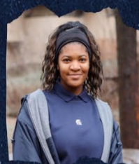
@CEAN ENS U/S SINA Brynna Facials