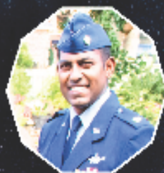
CAMP SPEAKER Lt. Col. Moses George (United States Space Force)